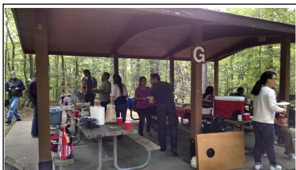
Fellows enjoying at the picnic at Black Hill Regional Park to celebrate the National Postdoc Appreciation week.

This year, National Postdoc Appreciation Week (NPAW), sponsored by the National Postdoctoral Association, was held from September 21 st -25 th . With events taking place at universities and research organizations all over the country, the CCR-FYI association participated in the festivities by hosting a picnic for all NIH fellows at Black Hill Regional Park in Boyds, MD on September 26 th ,