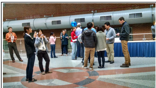
Fellows enjoying ice-cream and music at the OITE- sponsored Fellows Fest to celebrate National Postdoc Appreciation week.

NIH. Festivities included ice cream and music, and CCR-FYI hosted a table at the event, to help promote the CCR-FYI and to recruit new members.