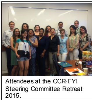
Attendees at the CCR-FYI Steering Committee Retreat 2015.