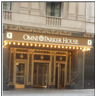
Omni Parker House, founded in 1855, one of the oldest in the US, was the venue of the Integrative Molecular Epidemiology workshop.