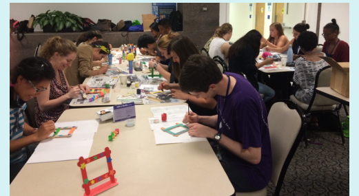
Top photo: monthly Postbac Committee Meeting