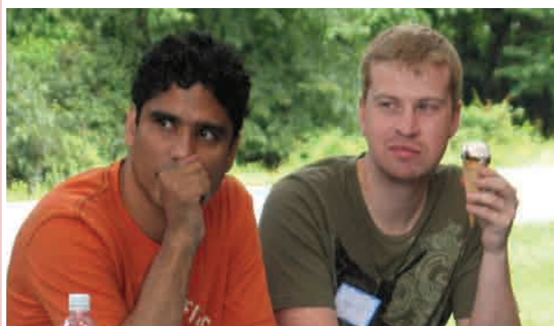
Pictures from the FYI picnic. Top right: Two individuals throwing a football . Middle left: Fellows enjoying some ice-cream while talking science. Lower left: Individuals participating in the relay game. Lower right: Results from the balloons and beakers game.